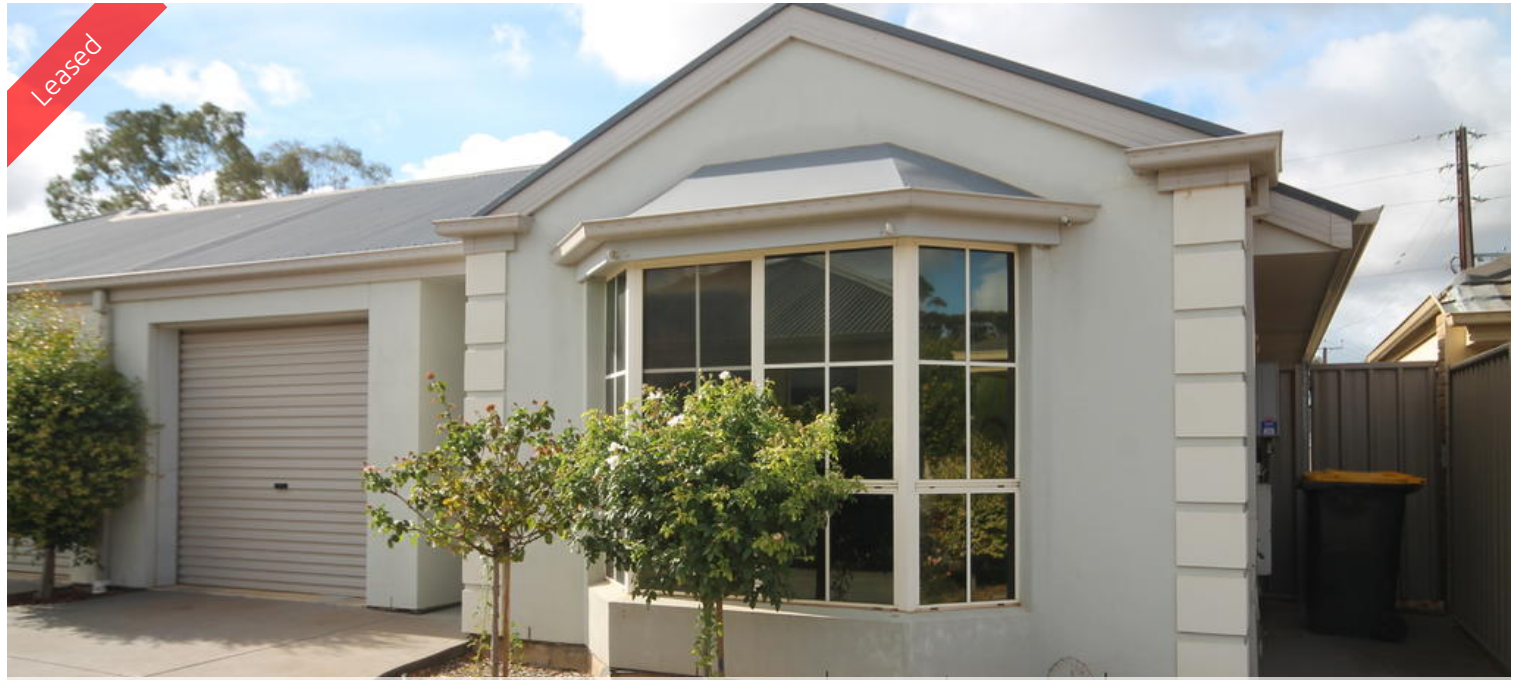
Unit 9, 1 McGonigal Dr, Willaston