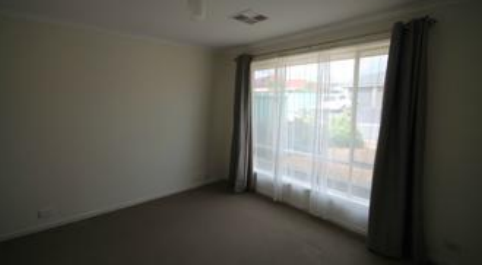
🔚 3 🔊 2 🖨 1

The above information provided has been furnished to us by the vendor/s. We have not verified whether or not that information is accurate and do not have any belief in one way or the other in its accuracy. We do not accept any responsibility to any person for its accuracy and do no more than pass it on. All interested parties should make and rely upon their own inquiries in order to determine whether or not this information is in fact accurate.