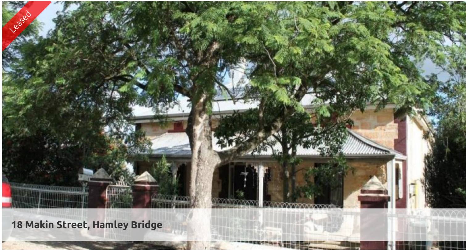
18 Makin Street, Hamley Bridge